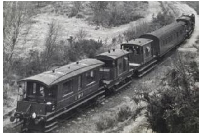
LMR train on the Hollywater loop

Here the same way back to Liss can be taken but if you fancy more you can turn left by the Smile with Kyle board to go through gate and take the right track to go shallowly uphill soon passing a pond with high earth walls around. This used to an explosive training pit and this area used to have red flags when it was in use. The route continues on the same stone chipped track along to the high communications aerial. Here the route curves right around the aerial, past the concrete triangulation pillar and along parallel to the hill ridge top.