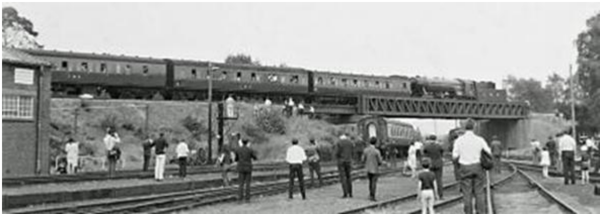
East approach to the photograph above, now the site of the A3 bypass

After the bridge the route turns left at the track tee junction and continues along the stoned track. This section of the LMR was first built in 1903 as a narrow gauge railway to transport unsuitable huts from Longmoor camp to Bordon. This was changed to standard gauge rail track in 1907 when the importance of using railways to quickly transport troops and materials was realised. It was originally called the Woolmer Instructional Military Railway until it changed to LMR in 1935.