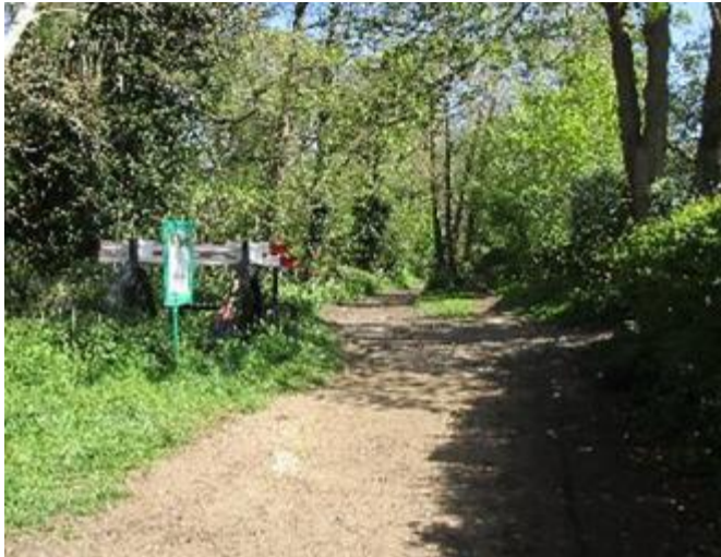
Old Railway start with buffer on the left

After the second cutting the same track is used to reach the distinctive timber boarding with Smile with Kyle on. Here to cut the route short you can turn right and follow the right track fork shallowly uphill as following later.