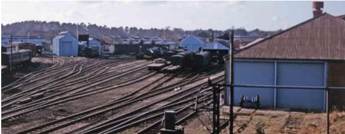
Railway yard to the East of Longmoor camp (pre 1969!)