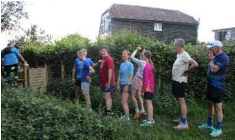
Queuing to get over a stile.

The 7 milers went further East with a tough climb up to Older Hill and some more fantastic views before dropping down to the hamlet of Redford, along passing Slathurst Farm and back to Milland.