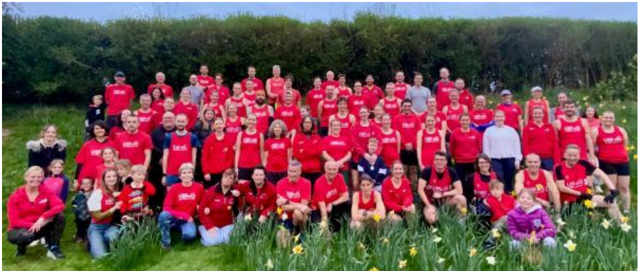
Club Photograph before The Trevor's Challenge