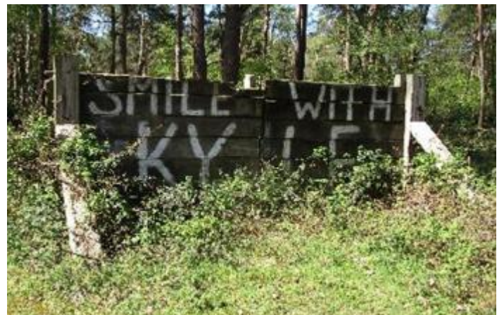
Smile with Kyle board