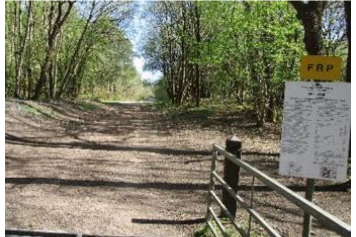
Site of Forest Road railway station