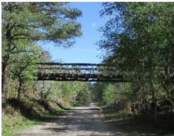
Second cutting, with bridge