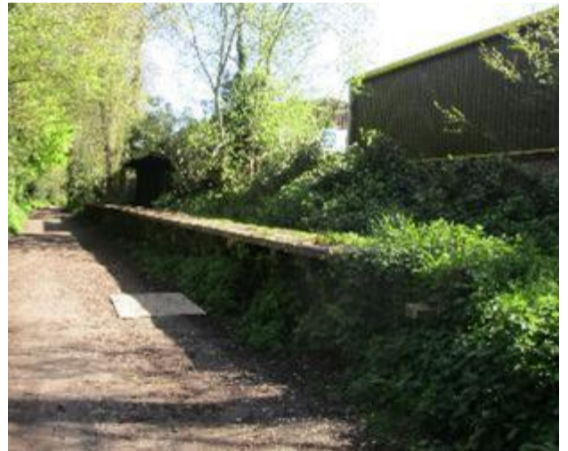
Old Liss Station platform