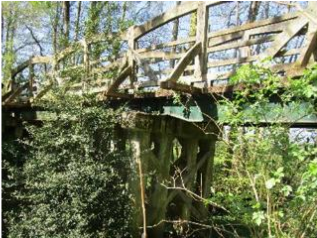
Sie of the old river bridges