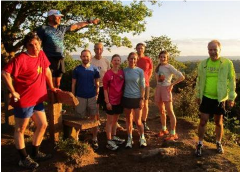
7 milers on Older Hill