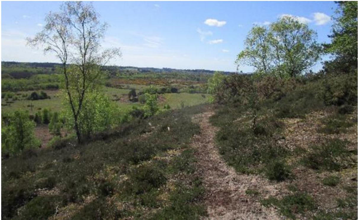
View South-East from near the triangulation pillar.