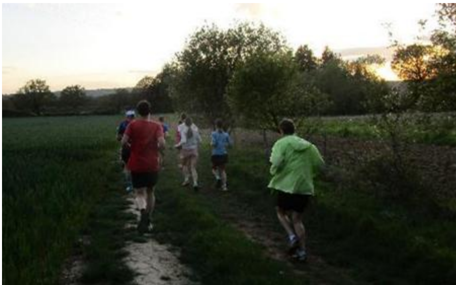
Almost back! In the strong sun set on a farm track towards Slathurst Farm.