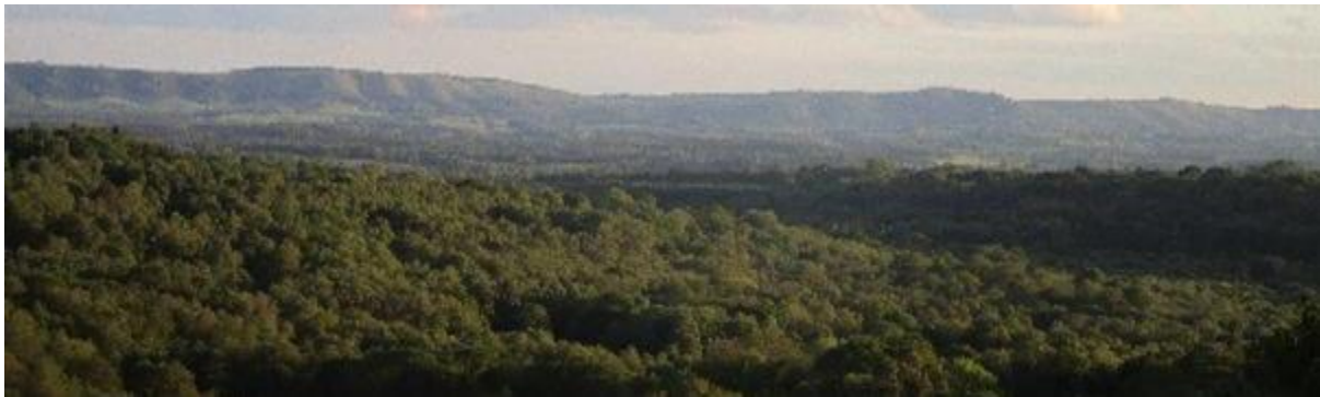
View from Older Hill