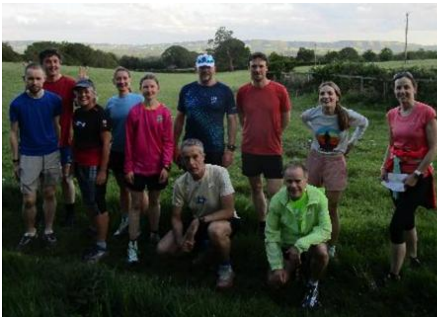
At the top of Dunner Hill