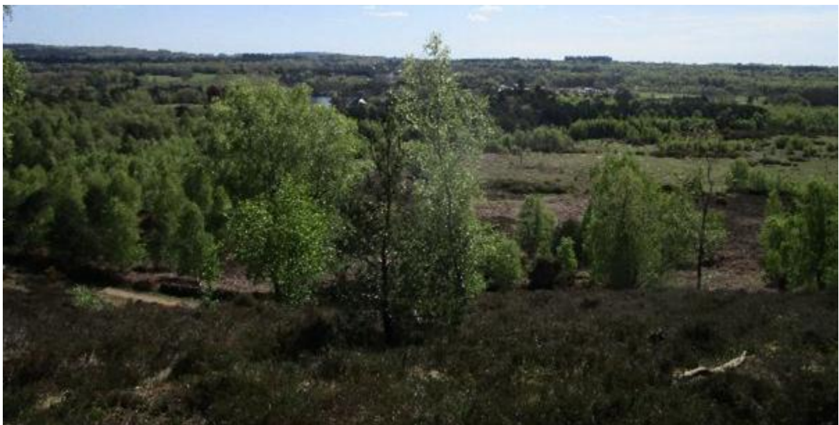
View North-East from near the triangulation pillar