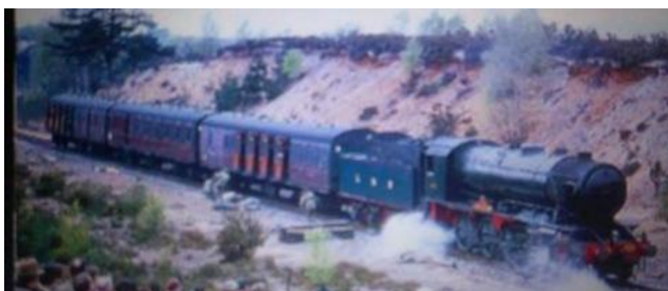
Engine "Gordon" in the first railway cutting North of Forest Road station: in the LMR blue livery: Still working: now on the Seven Valley Railway.

For the longer route continue straight on to rise and cross the A3 on the bridge. Just before if you looked left 60 years ago you would have seen many tracks:-