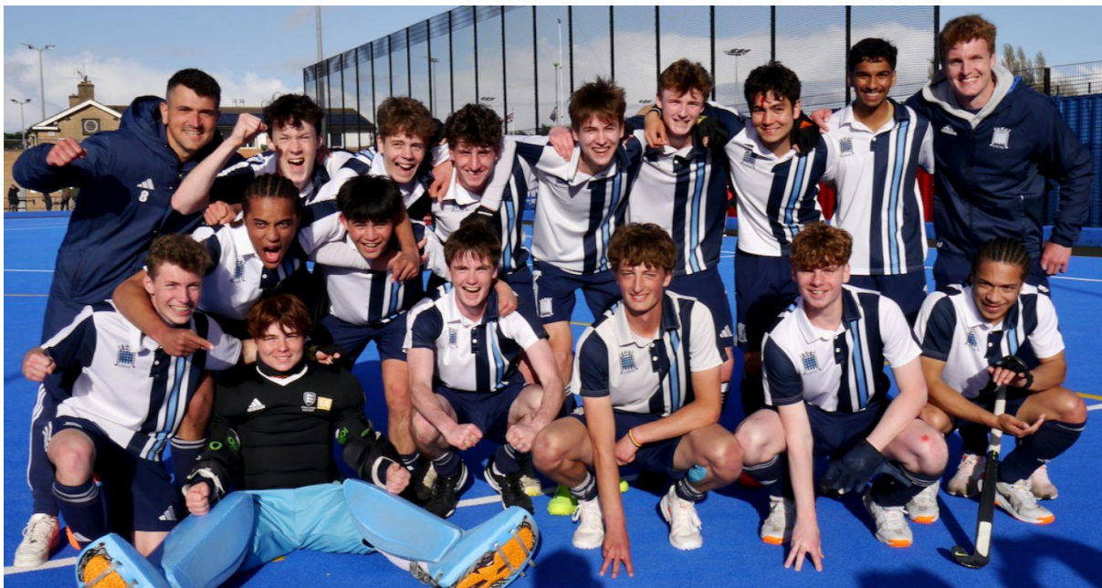
U18 Boys at Beeston Hockey Centre

The team will now head to the U19 Boys EHCO Trophy in Europe for Easter 2027 as the top English club, where they will face season winners from The Netherlands, Spain, Belgium and Germany.