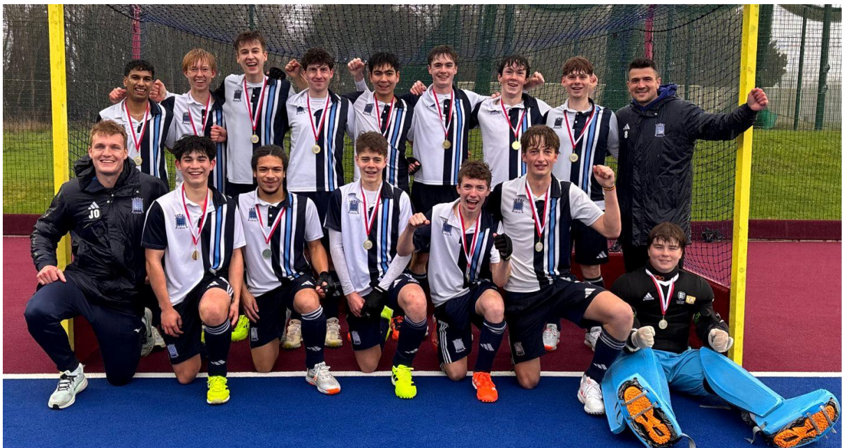
U18 Boys at Weybridge