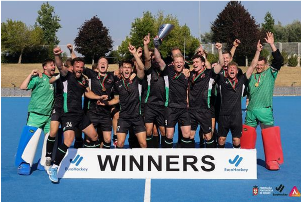
Victorious Men's team, with several Hampstead & Westminster connections