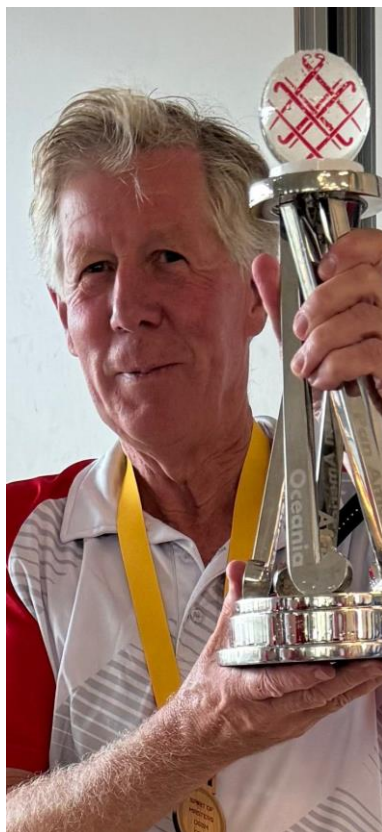
El Presidente with the silverware