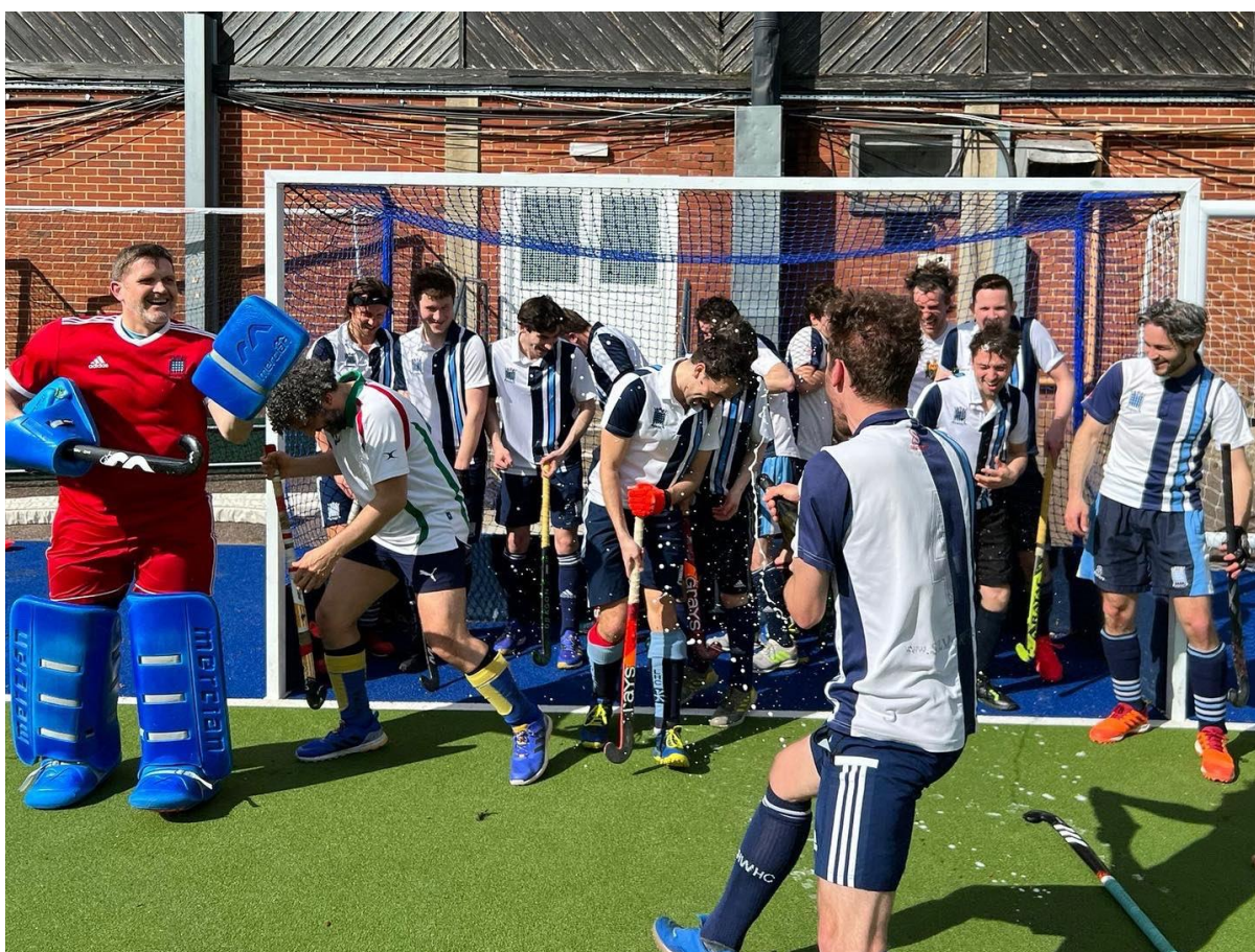
The Men's 4 th XI celebrates