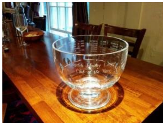
The Watson Bowl