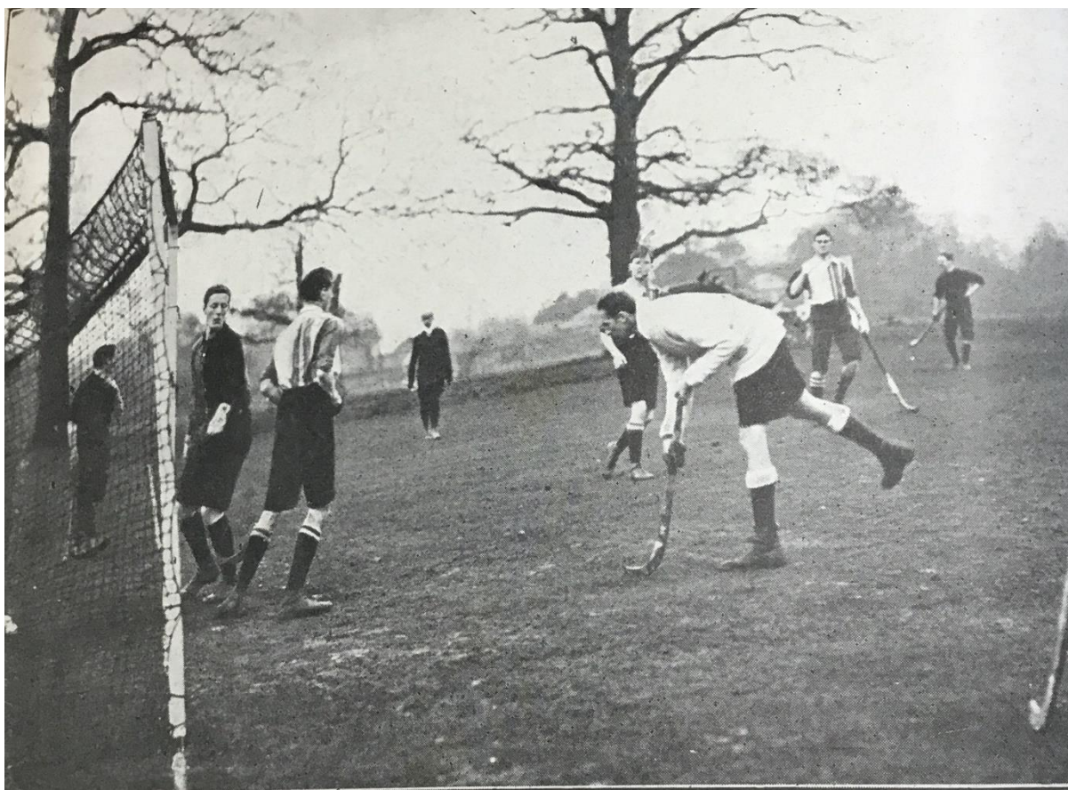
GOAL! HAMPSTEAD SCORE AGAINST SOUTHGATE.