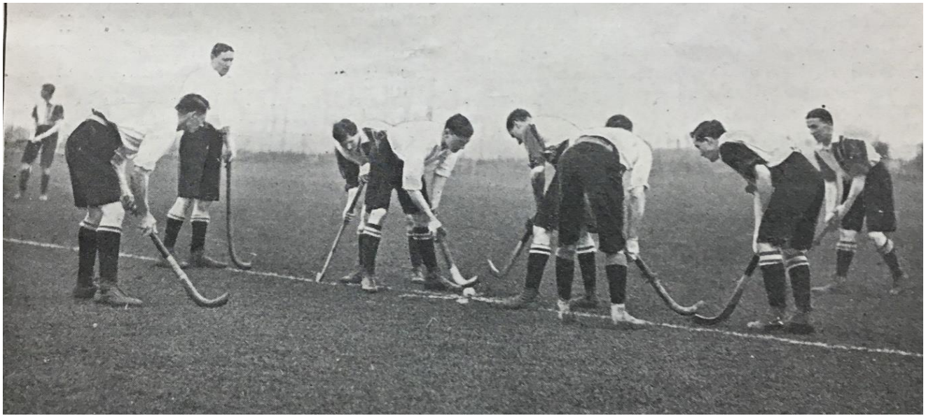
How games used start: Hampstead v Staines: at least 110 years ago