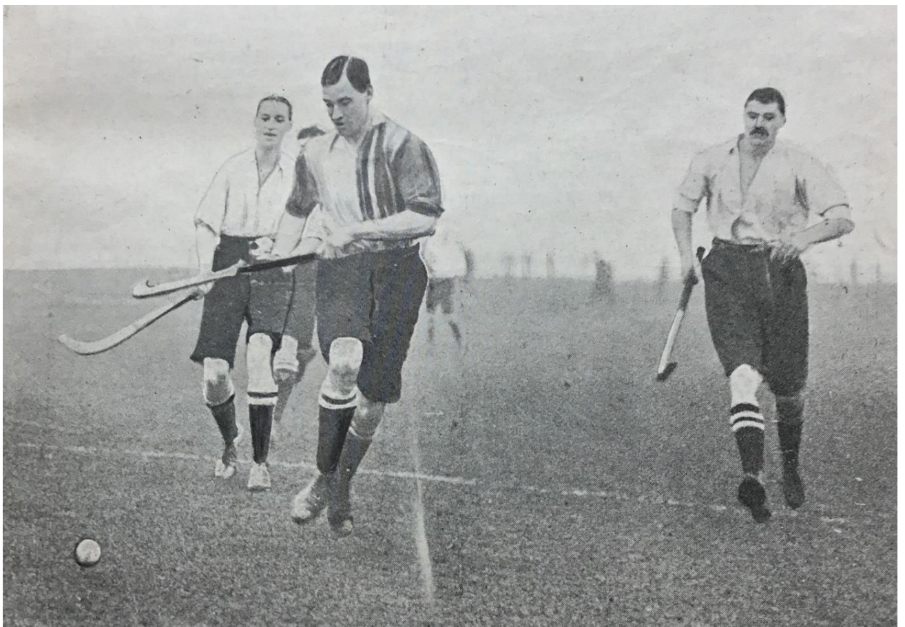
Not a hair out of place; in the same match