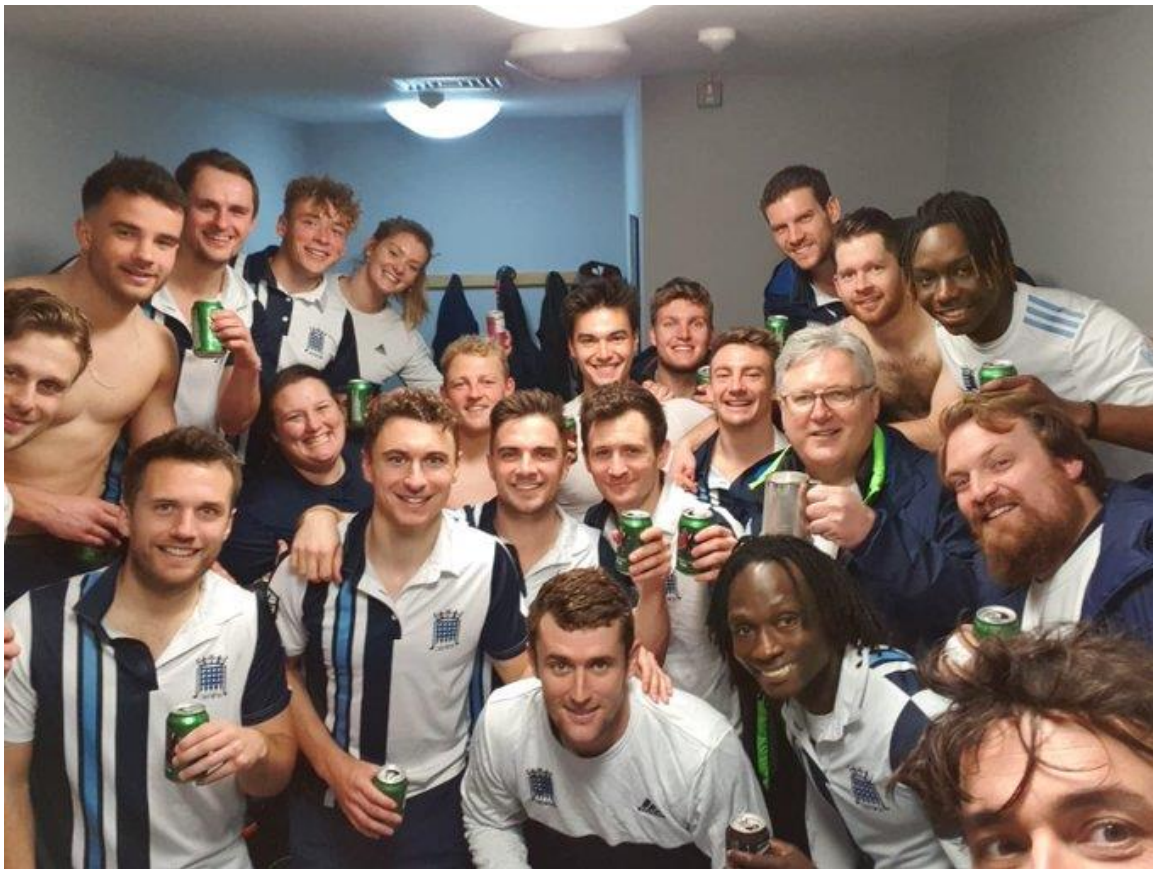
A small celebration after the final league match against Beeston