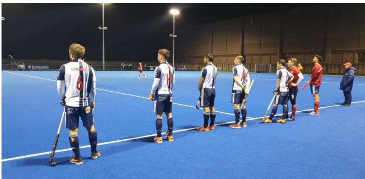
Bisham line up

The backdrop, below, will be familiar to many. Mid-week training for the Men's 1s on 27 February 2020 took place at Bisham Abbey, when they took on the Great Britain squad. It was however too cold for a full session and the match had to be called off when the pitch began to freeze..