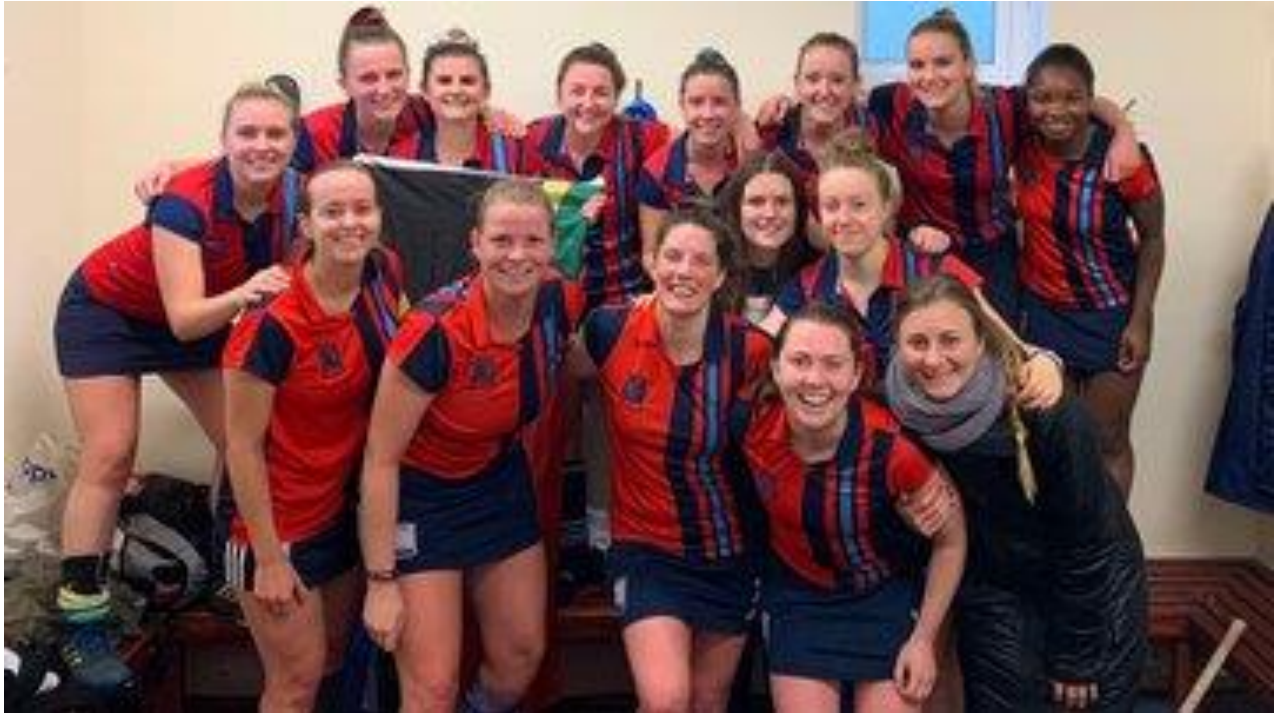
And in the away kit

The other women's team to win a League this season were the 6 th XI in Middlesex Division 1, covered later.