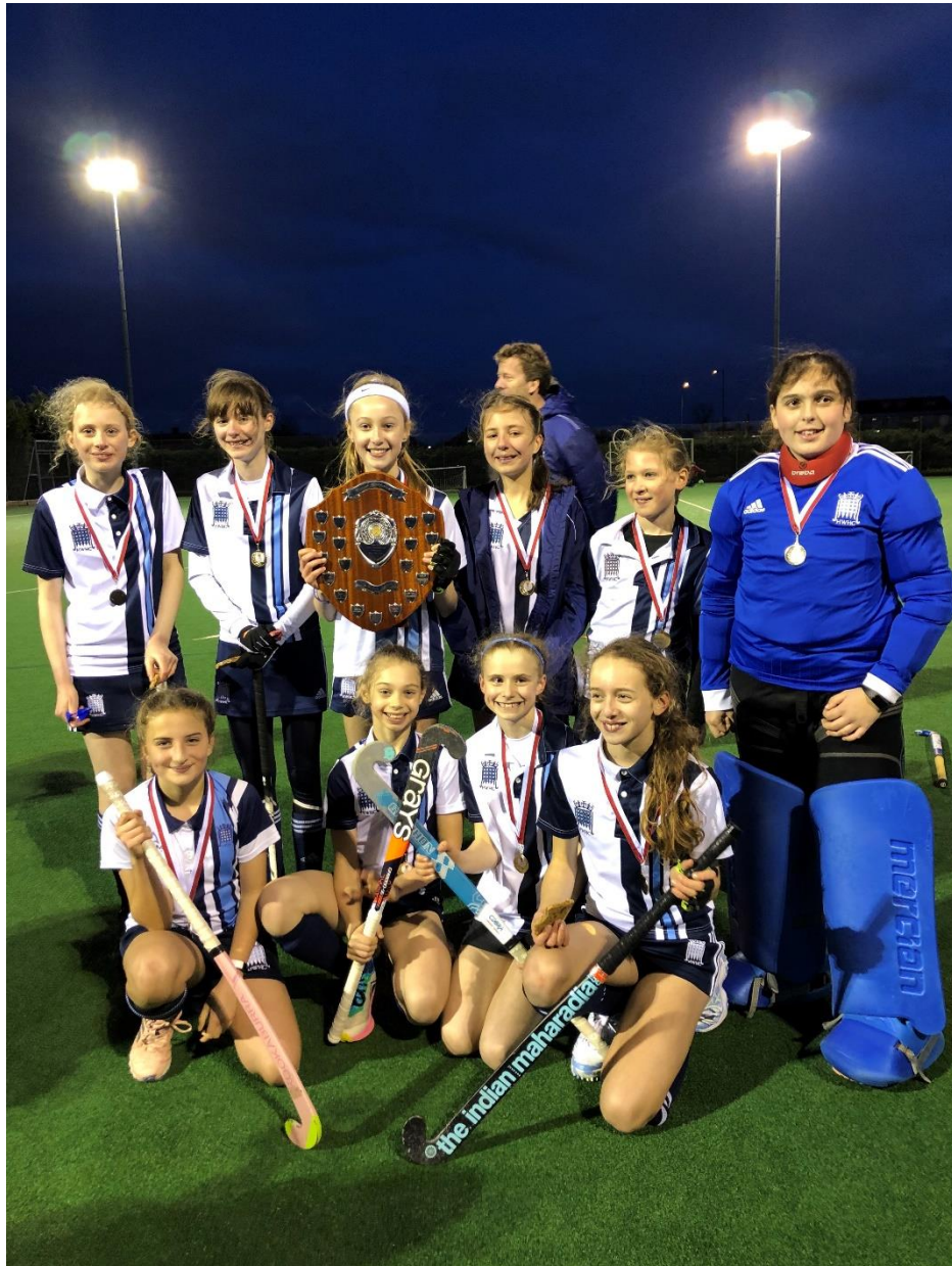
The U12 Girls at the Middlesex competition