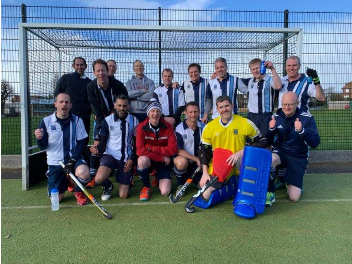
The Veterans XI

In the Masters Over 40 League, the Vets XI are third having reckoned on a chance as winners, only to be pipped in the final matches. The H&W London Grandmasters XI were in sixth place in the Over 60 Division 1 and also had a team in the Over 60 Division 2 that after five games were placed top with three wins and two draws.