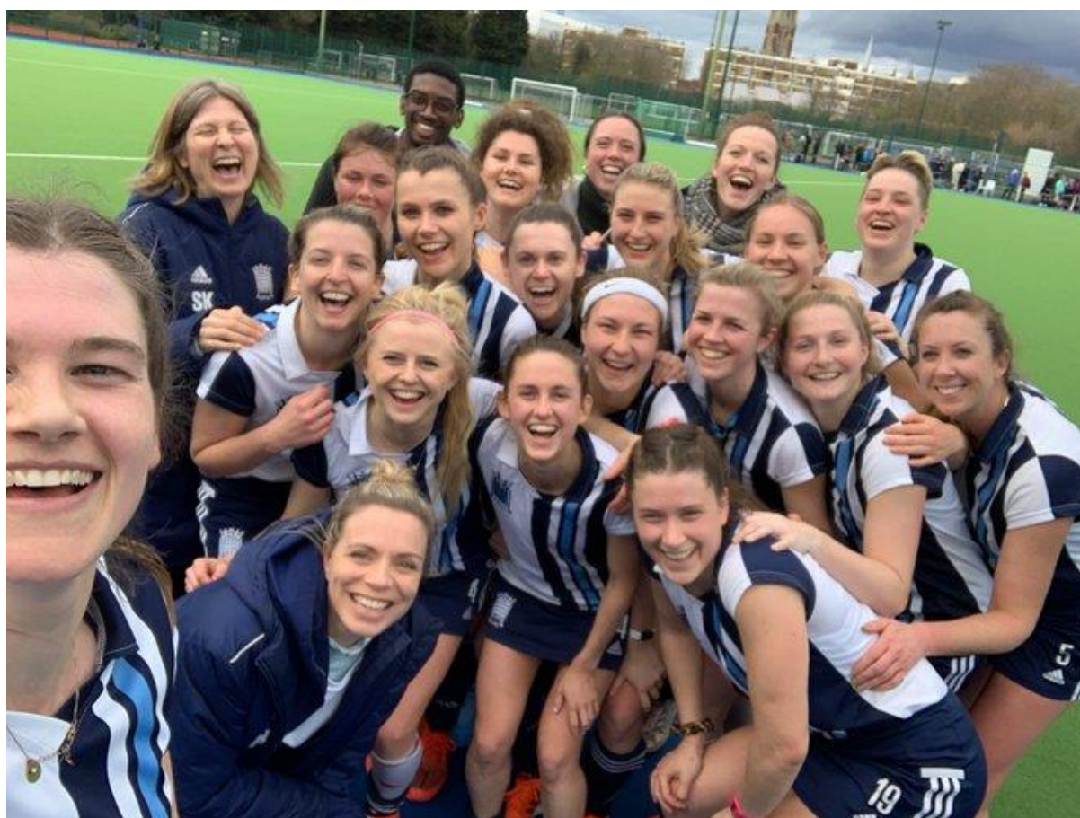
Women's 1 st XI

Sadly, Bowdon were relegated having been in the Division since its inception.