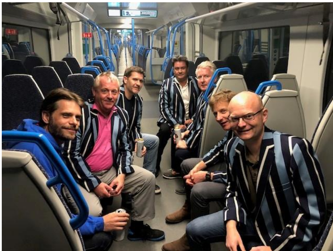
En route to Peterborough