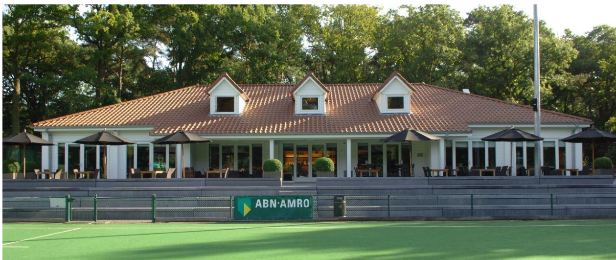
KHC Dragons Clubhouse

In the Men's 60+ competition, the top three ranked teams were England the Netherlands and Scotland. In the final, England defeated the Netherlands 3-2 and in the 3 rd v 4 th places match, Scotland beat Germany 4-3.