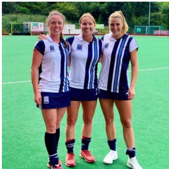
H&W's GB international trio

Women’s 1 st XI v University of Birmingham at 1530h