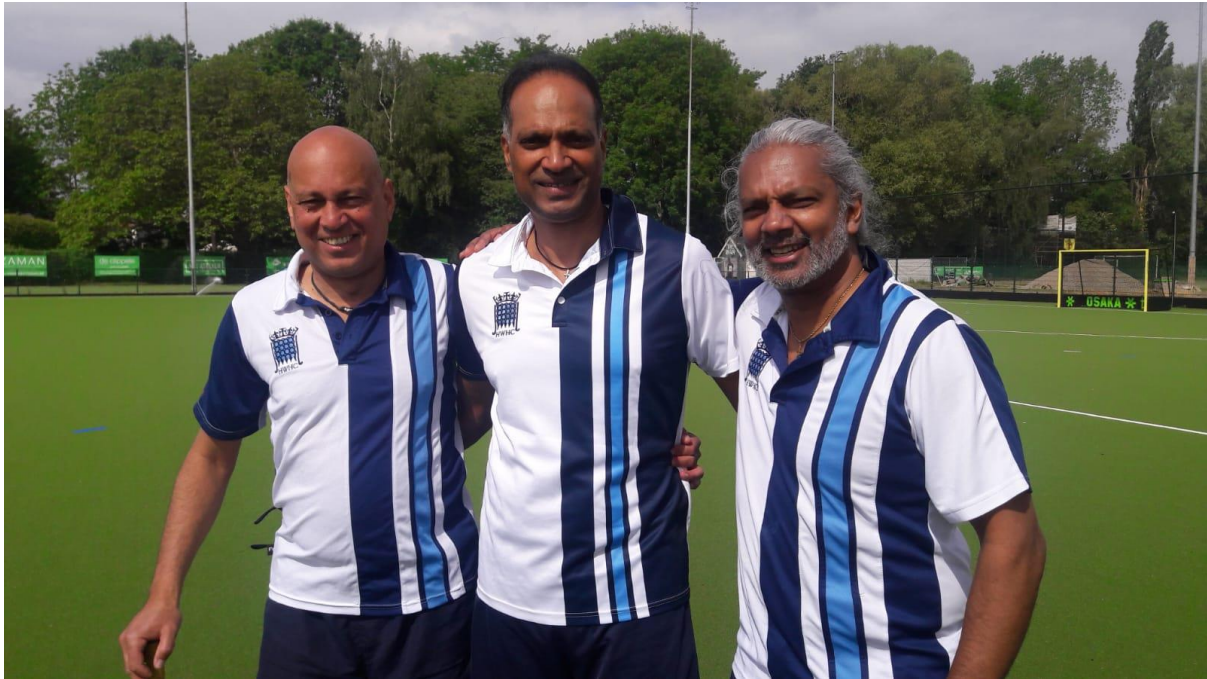
The Goan Brethren

Our Temse hockey friends even ferried us back to Bornem after dinner, where some extra late-night training was added to the schedule. After over-exertion by some late on, our second match against the Belgian Old Lions on Saturday morning was not our best and is best forgotten.