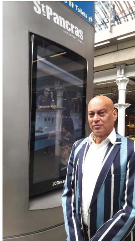
The Goa Constrictor