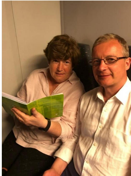
Bringing up the rear?