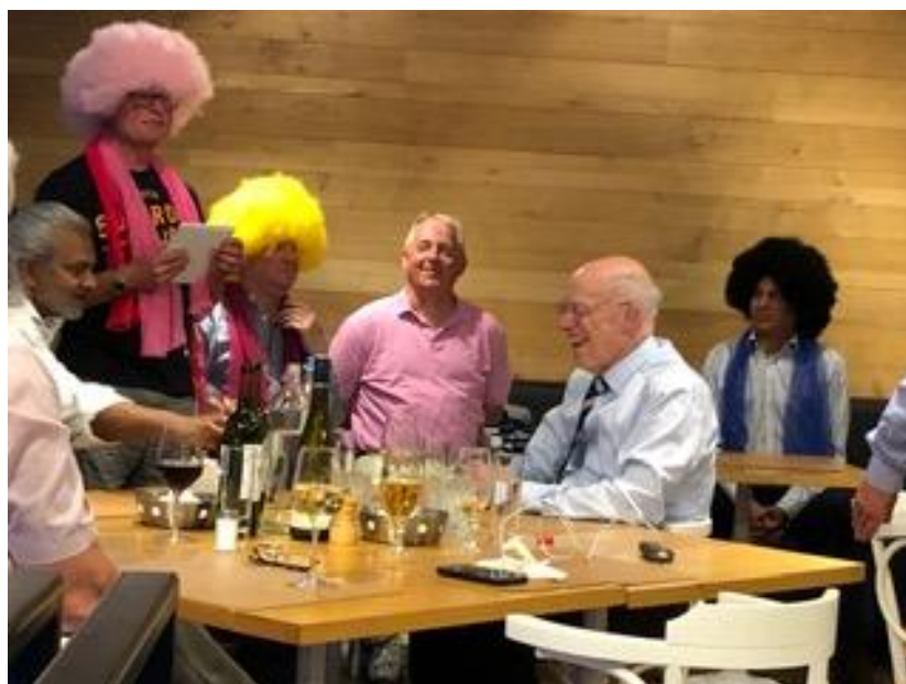
In the Courtroom

He endeavoured to smear the Supreme Commander's reputation with every wrong thing he could think of. Happily, the Supreme Commander was not deemed sufficiently guilty as to warrant the sentence handed to poor Admiral Byng RN in a previous century: he was executed 'pour encourager les autres'.