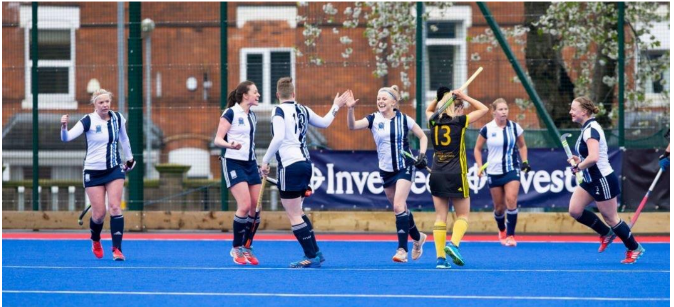
Hampstead score against Beeston in the Play Offs

having taken the lead in the third minute. They were then beaten 2-1 by Beeston, who managed to fend off incessant Hampstead attacks for the equaliser. In the final match, Hampstead defeated Stourport 4-0. However, Beeston, who has already achieved their promotion after two wins, were held 1-1 by Slough, who therefore retained their place in the Division.