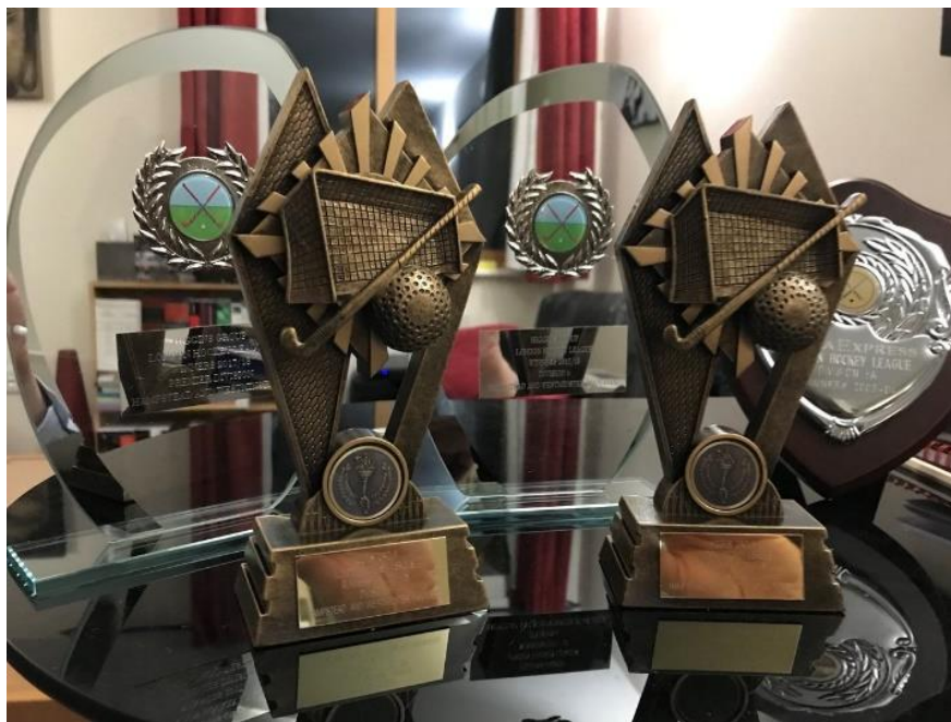
Hampstead's trophy haul in the London League