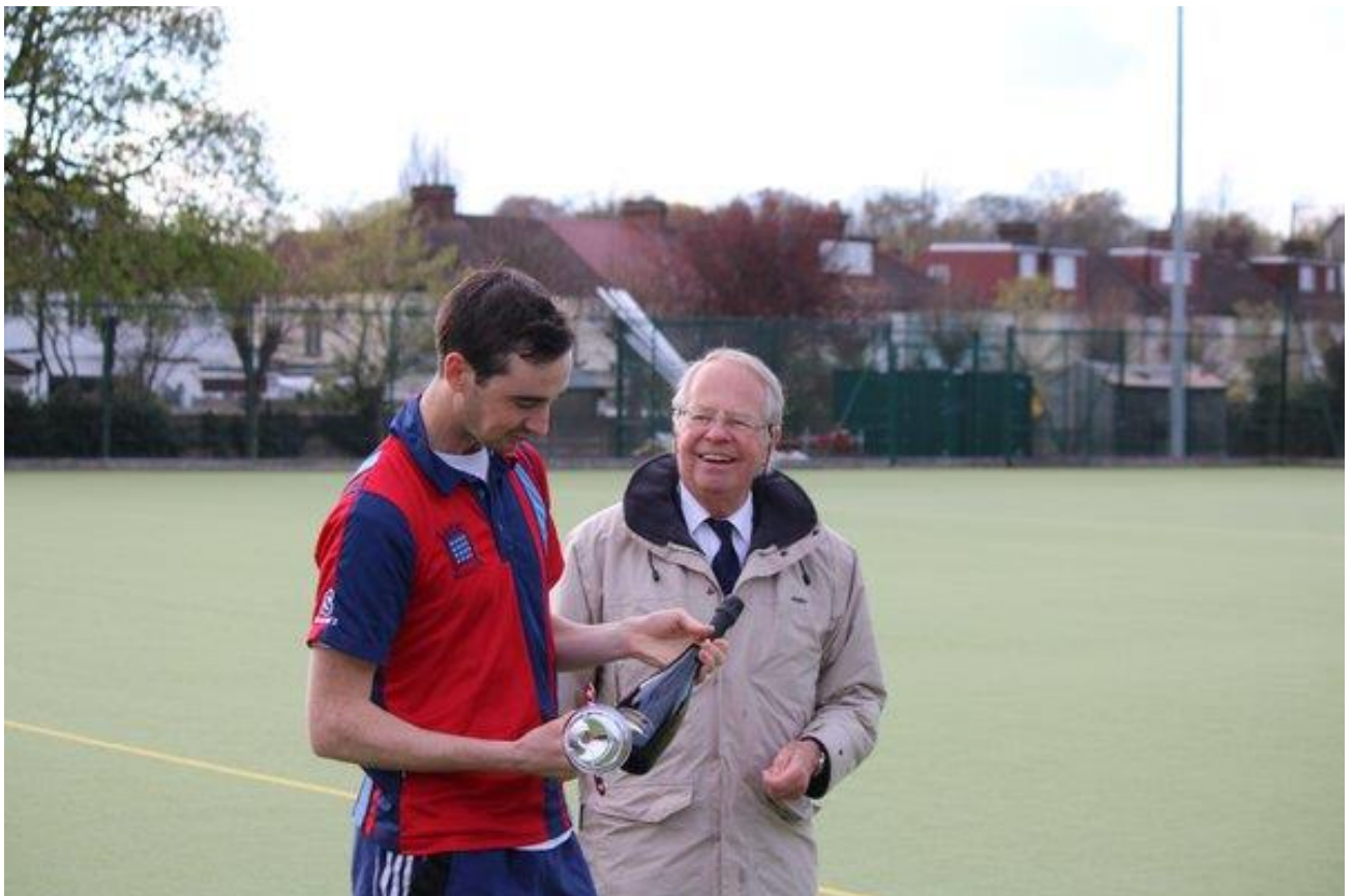
And, below, the winning team...

Last year Hampstead lost the Cup final to League runners up, Southgate 1-0, having won the League with many impressive victories. So this year the roles were to degree reversed and it was a big win for the 2’s.