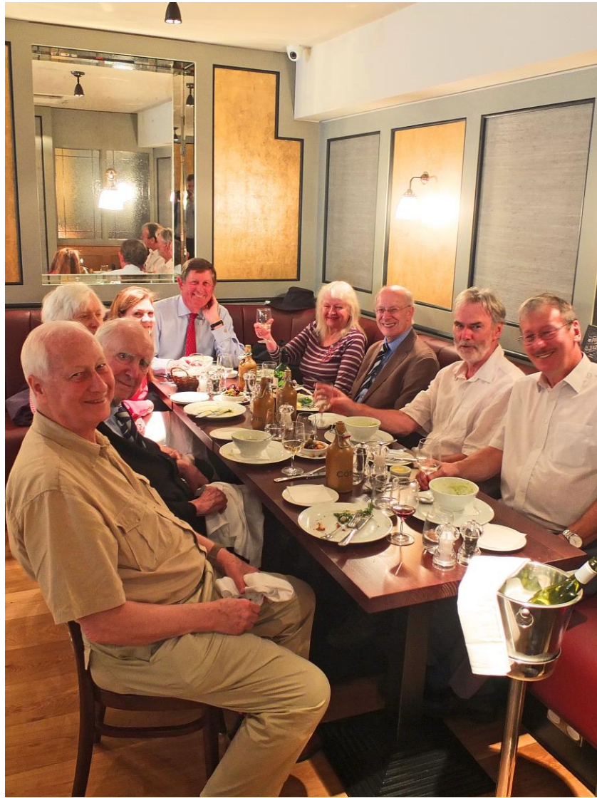
Lunch was served on 7 June 2016 in Peterborough